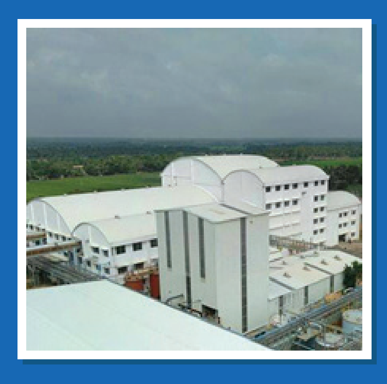
Cuddalore - Silica Plant